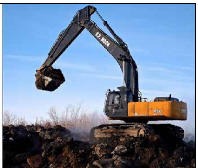
aus Große Dinge